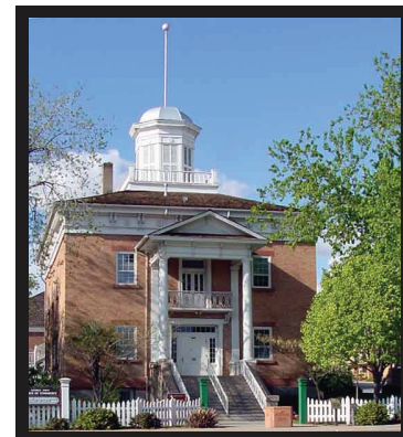
The St. George Chamber of Commerce is located in the historic Old Courthouse at 97 E. St. George Boulevard.

Plan on attending one or all of these free workshops to build the skills you need. For more information, call the St. George Chamber of Commerce at 435-628-1658.