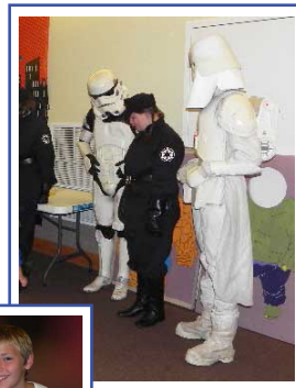
Members of the 501 st Legion greet young Star Wars fans at the Hurricane branch.

The Library System would like to thank the volunteers, presenters, and sponsors that participated in creating one of the most fun and exciting Summer Reading Programs to date!