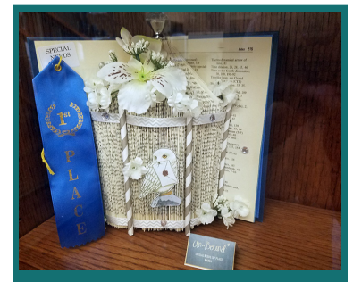
First place entry in the Special Needs category titled "Hedwig", was created by Manda.