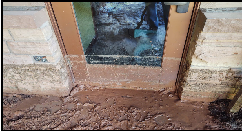
The exterior entrance on the west side shows the water level of the flood.

Water levels reached between 18 and 24 inches during the initial flood, covering the exterior walkways and parking areas in mud. Clean up efforts are underway and the branch will reopen when the restoration is complete.