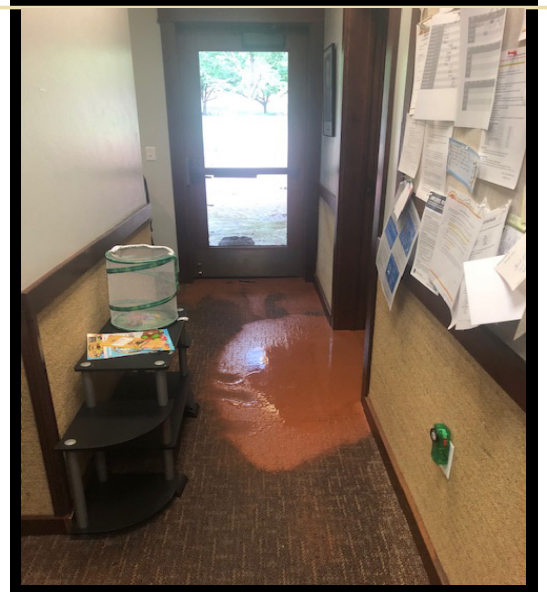
The staff entrance and server room where water and mud entered.