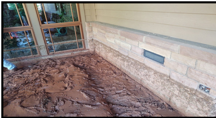
The sidewalk and parking area covered in mud and debris from the sudden cloudburst.